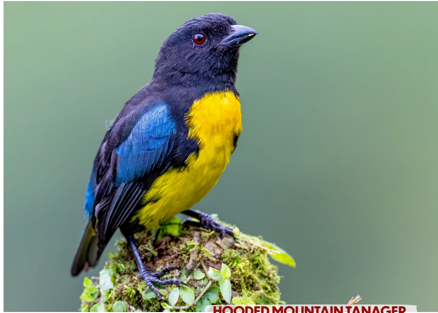
HOODED MOUNTAIN Tanager

Day 10 / Otún Quimbaya / Sunday, Sept. 13th.